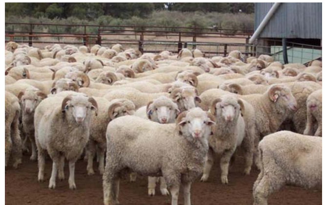
Alma Sale Rams – April, 2008