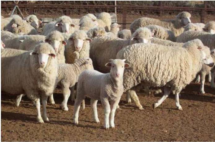
Alma Lambs – 2008 Drop

Seasonal Conditions: It is very clear we are experiencing a climate variability that is making the management of any livestock a challenge, not to mention keeping up your production from Wool, Sheep and Meat Sales . Our present seasons are very similar to the 1900 – 1950's, we all need to consider our properties operation and breeding program.