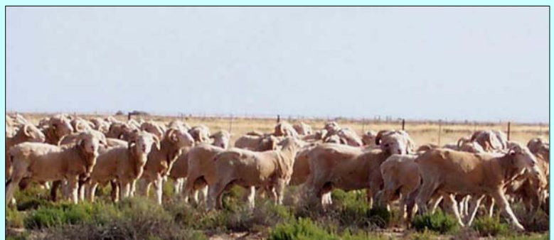
Alma Sale Rams – July 2008

Alma Ram preview day Thursday 11 September.