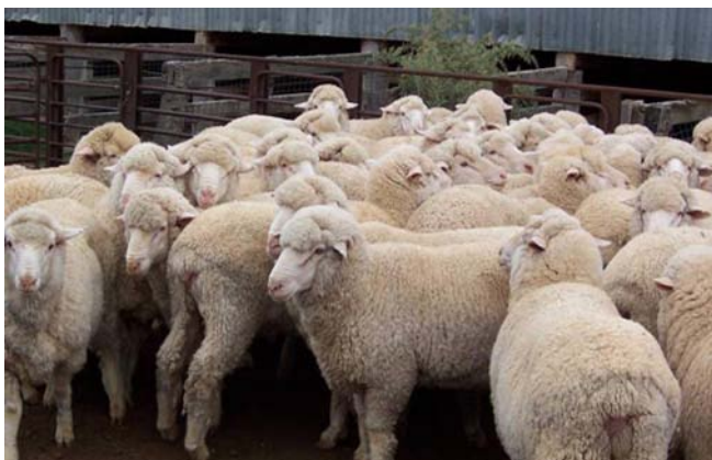
Alma Sale Polls – April, 2008