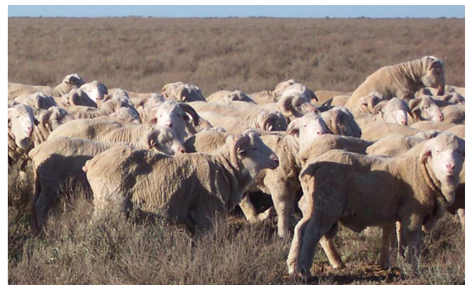
Alma sale rams July 2003

This year’s sale rams have come through the drought exceptionally well. They are well grown and looking fit to join. They were given supplementary feed over summer but have survived since March on Old Man Saltbush with no extra feed. They were shorn 6 th May and will be classed by Ian Lilburne shortly, ready for sale at our ram day, 25 th September.