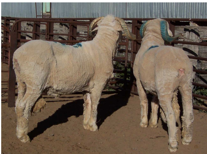
Collinsville sires, purchased October 02

Stud ewes & lambs: Joining was delayed until early December. The stud ewes were scanned in March with the great majority in lamb. The lambs were marked in mid-July, with 115% - a great result from a marginal season overall.