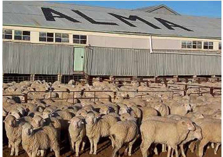
Classing 2003 - Alma 2002-drop young ewes

For Alma clients and Western woolgrowers 2003